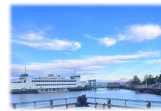
Mt. Rainier behind Puget Sound and ferry

For our Banquet Dinner, we went to Anthony's Seafood restaurant, and sat outside on the waterfront, watching the sunset throw beautiful colors on Mt. Rainer.