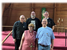
Top: ECD members Bottom: Clergy only

The 76th Episcopal Conference of the Deaf convention was truly a memorable event. The community, engaging presentations, discussions of an upcoming pilgrimage, and the local excursions were heartwarming and fulfilling. This convention served to strengthen bonds and inspire future workshops and goals within the ECD community. The next ECD Convention is already in the works and will most likely be in, or around, St. Louis, MO in 2026.